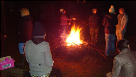
Keeping warm around the campfire

Additionally we have had away trips, visits and activities. We have been bowling, climbing (at the Gloucester Climbing Centre) and visited the SkillZone. Valentine’s Day was celebrated by on outing to a restaurant. We had a trip to Birmingham Pride and the group also had a presence at Gloucestershire Pride in Gloucester Park in June.