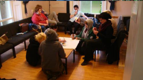
Kitted out for caving