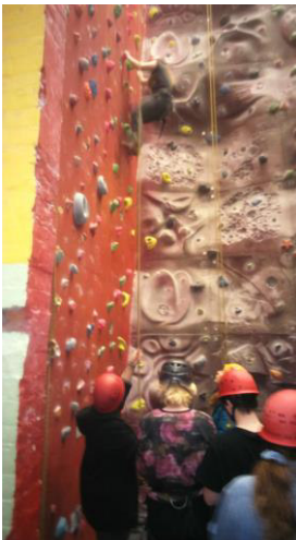
Climbing Centre, Gloucester

Our youth group completed almost 3 years of running at the end of March 2015 and continues to flourish. It currently has funding from the Police and Crime Commissioner’s Fund until March 2017. After the loss of two venues and youth workers since the group started in 2012 we have gained some stability from locating a permanent ‘home’ and establishing links with Youth and Community Services who provide our paid youth worker. We remain Accredited as a Partner Club of Young Gloucestershire.